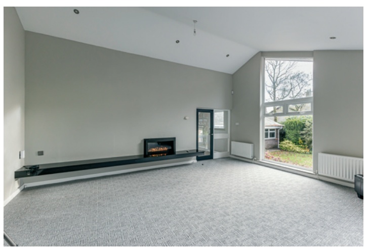
SITTING ROOM/STUDY: 14' 3" \times 10' 5" (4.34m \times 3.18m) Display shelves.