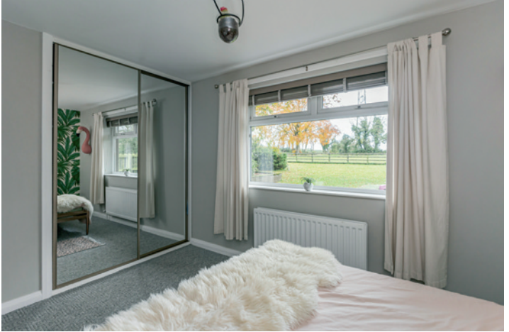
BEDROOM (3): 11' 7" x 9' 6" (3.53m x 2.9m) Built in slide robes and storage. BEDROOM (4)/PLAYROOM: 16' 4" x 10' 3" (4.98m x 3.12m) (at widest points)