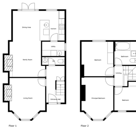
Sizes And Dimensions Are Approximate. Actual May Vary.

From the Upper Newtownards Road, turn onto Beersbridge Road. Sagimor Gardens is third on the left and property located on the right.