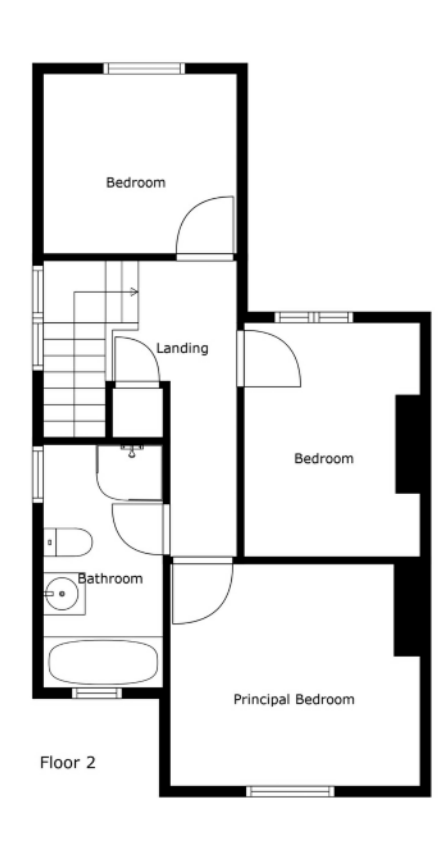
Sizes And Dimensions Are Approximate. Actual May Vary.