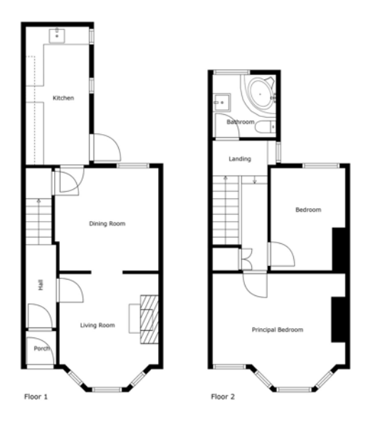
Sizes And Dimensions Are Approx

Travelling along the Beersbridge Road in the direction of Belfast, turn right onto Ravenscroft Avenue. Property located on right. Alternatively, heading out of Belfast, at the Holywood Arches where road become Upper Newtownards Road, take immediate right onto Ravenscroft Road. Property on left.