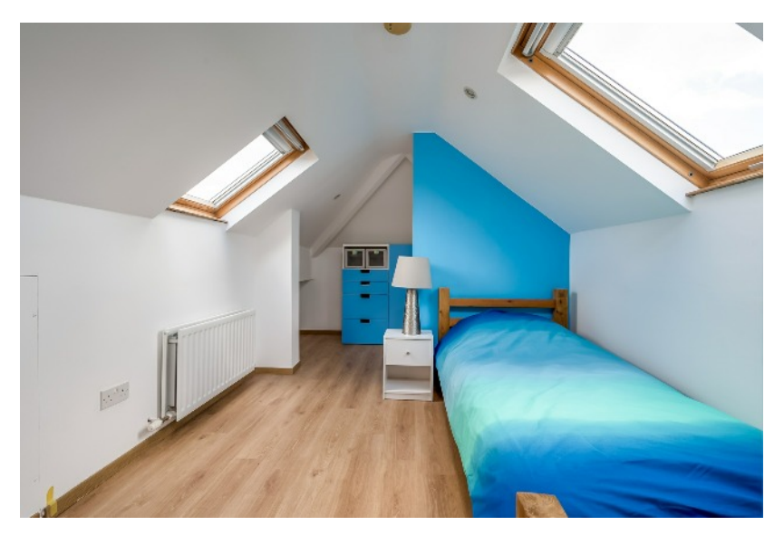
STUDY: 11' 10" x 8' 10" (3.6m x 2.7m)

BEDROOM (4): 17' 5" x 8' 10" (5.3m x 2.7m) (at widest points).