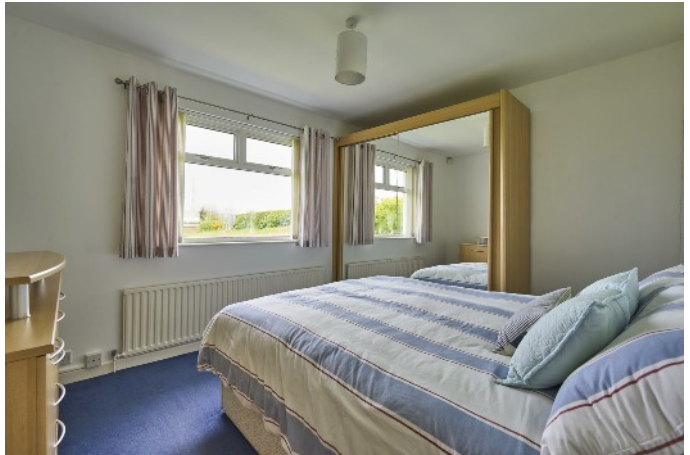
BEDROOM (4)/STUDY: 9' 6" \times 8' 6" (2.9m \times 2.6m)