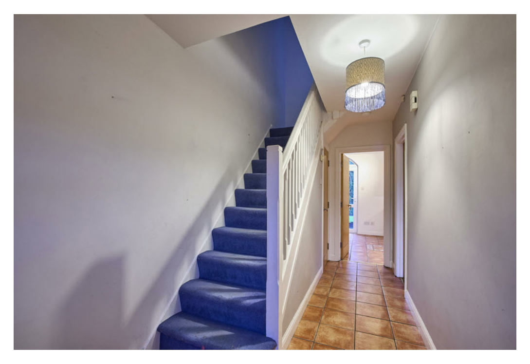
LOUNGE: 17' 0" x 13' 8" (5.18m x 4.17m) Polished fireplace, gas coal effect fire, solid wood floor.