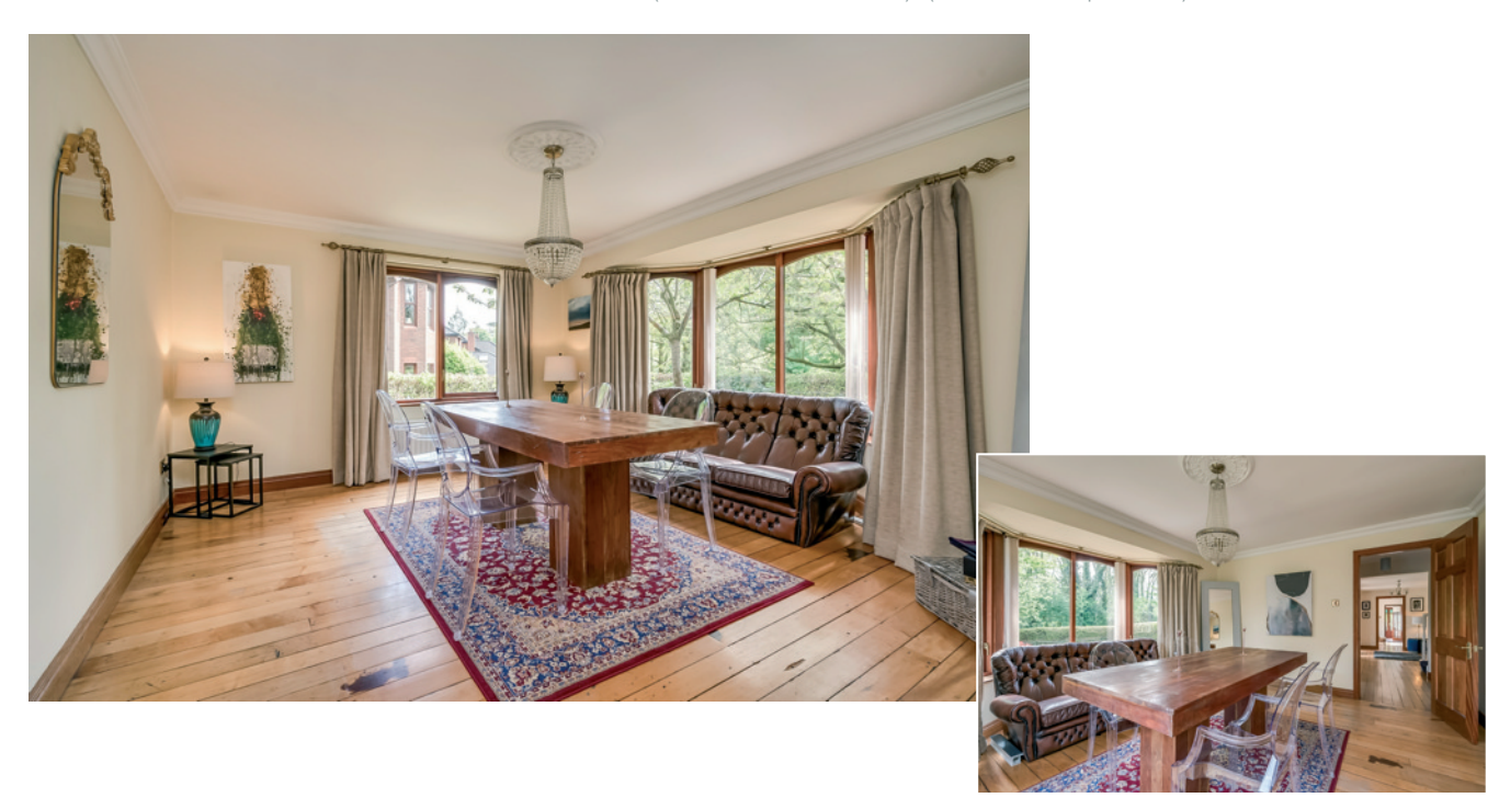
LIVING ROOM: 14' 7" \times 14' 5" (4.44m \times 4.39m) (at widest points into bay). Cornice ceiling, ceiling rose, sanded and varnished floor boards, bay window.