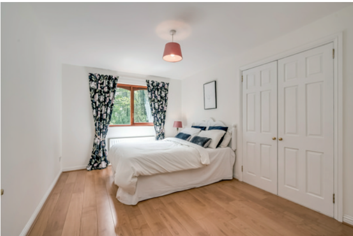
BEDROOM (4): 16' 5'' \times 9' 2" ( 5m \times 2.79m ) (at widest points). Full length built-in wardrobes and storage, laminate wood effect floor.