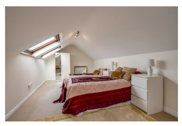
BEDROOM (4): 21' 1" x 10' 1" (6.43m x 3.07m) Velux window.