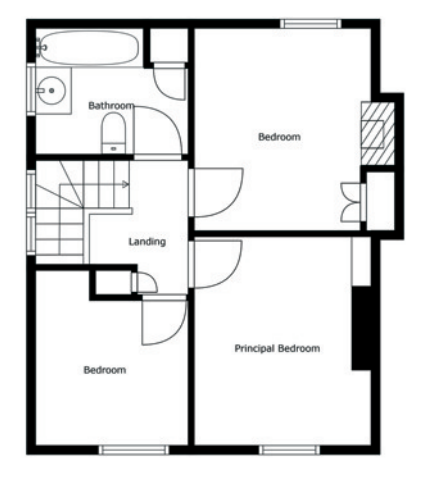
Sizes And Dimensions Are Approximate. Actual May Vary.