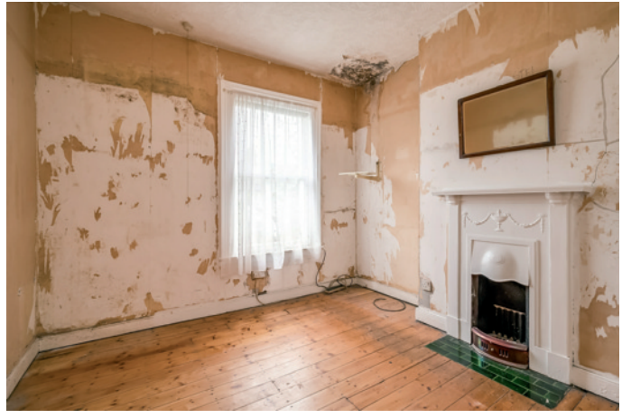
BEDROOM (3): 8' 4" x 7' 10" (2.54m x 2.39m) Access to roofspace.

BATHROOM: High flush wc, panelled bath with shower over, part tiled walls, part panelled walls, airing cupboard, access to roofspace.