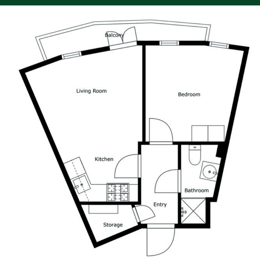
Sizes And Dimensions Are Approximate. Actual May Vary.

Lisburn Road - 028 90 66 3030 Ballyhackamore - 028 90 65 0000 North Down - 028 90 42 4747 Lisburn - 028 92 66 1700