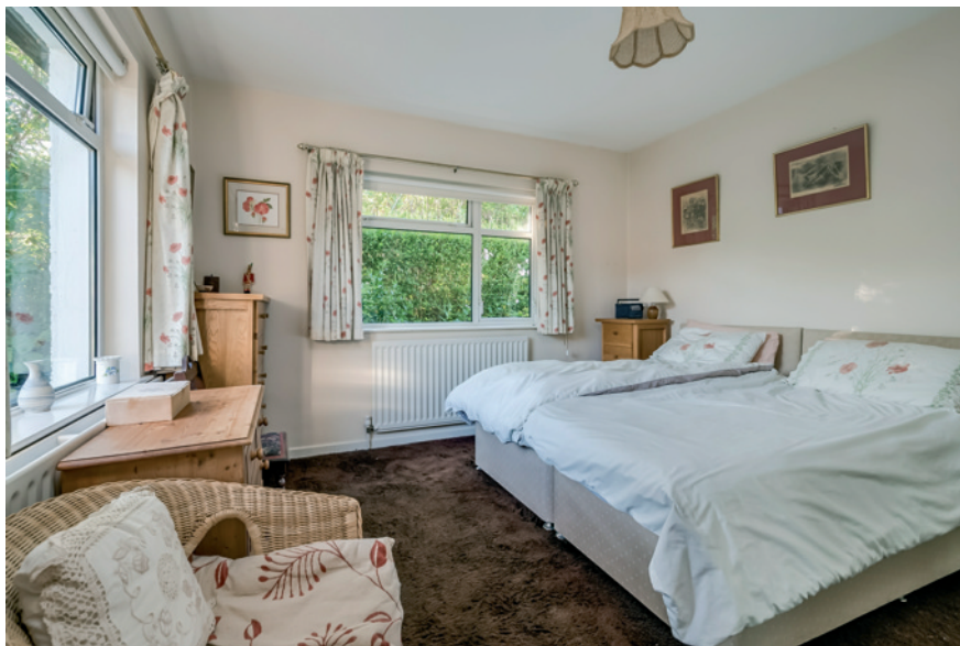
BEDROOM (2): 15' 2" x 11' 0" (4.62m x 3.35m) Corner wash hand basin.