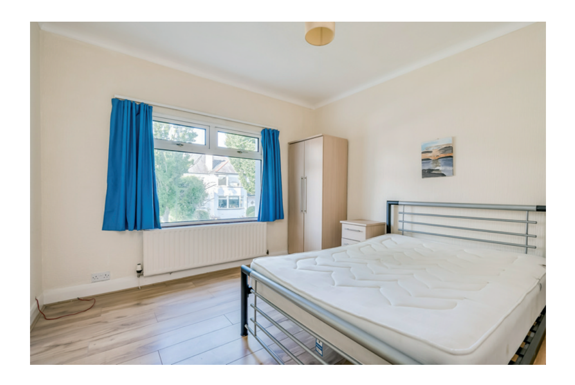
BEDROOM (3): 12' 1" \times 10' 4" (3.68m \times 3.15m) Built-in walk-in cupboard.

BEDROOM (2/SITTING ROOM): 12' 0" \times 10' 9" (3.66m \times 3.28m) Oak laminate wooden floor, cornice ceiling.