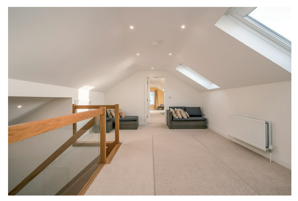
BEDROOM (4): 23' 4" \times 15' 0" (7.11m \times 4.57m) Velux window \times 2, excellent views across to Strangford Lough. Dual aspect windows, storage into eaves. Access to:

LANDING: Excellent storage into eaves. Fully floored. Velux window x 2, low voltage spotlights.