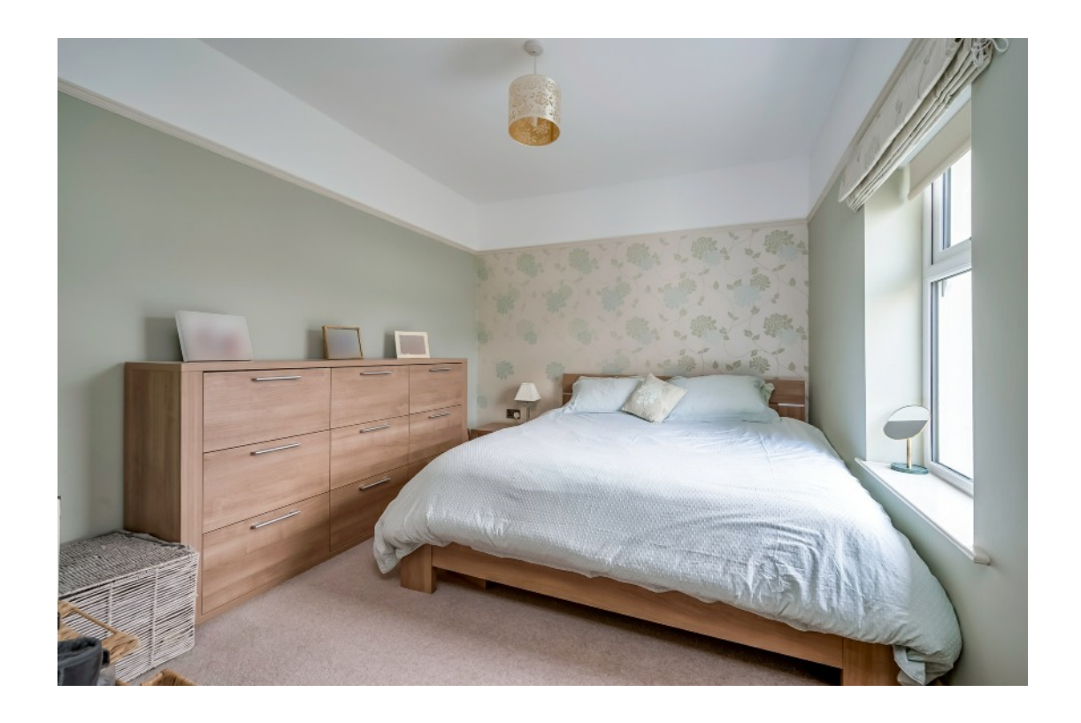
BEDROOM (3): 12' 4" x 9' 5" (3.76m x 2.87m) Picture rail.

BEDROOM (2): 12' 5" \times 11' 4" (3.78m \times 3.45m) Picture rail, timber surround fireplace.