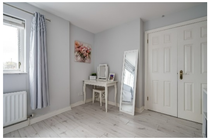
BEDROOM (2): 11' 4" x 8' 4" (3.45m x 2.54m) Laminate wooden floor.