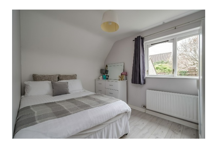
BEDROOM (3): 9' 5" x 8' 5" (2.87m x 2.57m) Laminate wooden floor.