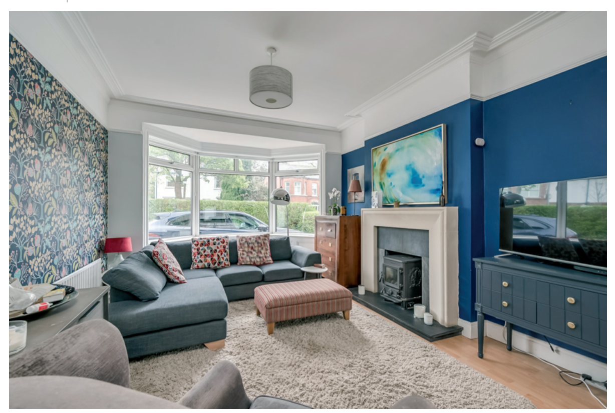
LIVING ROOM: 16' 5" \times 15' 4" (5m \times 4.67m) Feature fireplace surround and mantle with overmantle and inset mirror, built-in bookshelves on either side of fireplace.

DRAWING ROOM/DINING AREA: 27' 6" x 11' 10" (8.38m x 3.61m) Superb sandstone fireplace surround and mantle with cast iron gas stove, wood laminate flooring, PVC frames double glazed doors to rear patio.