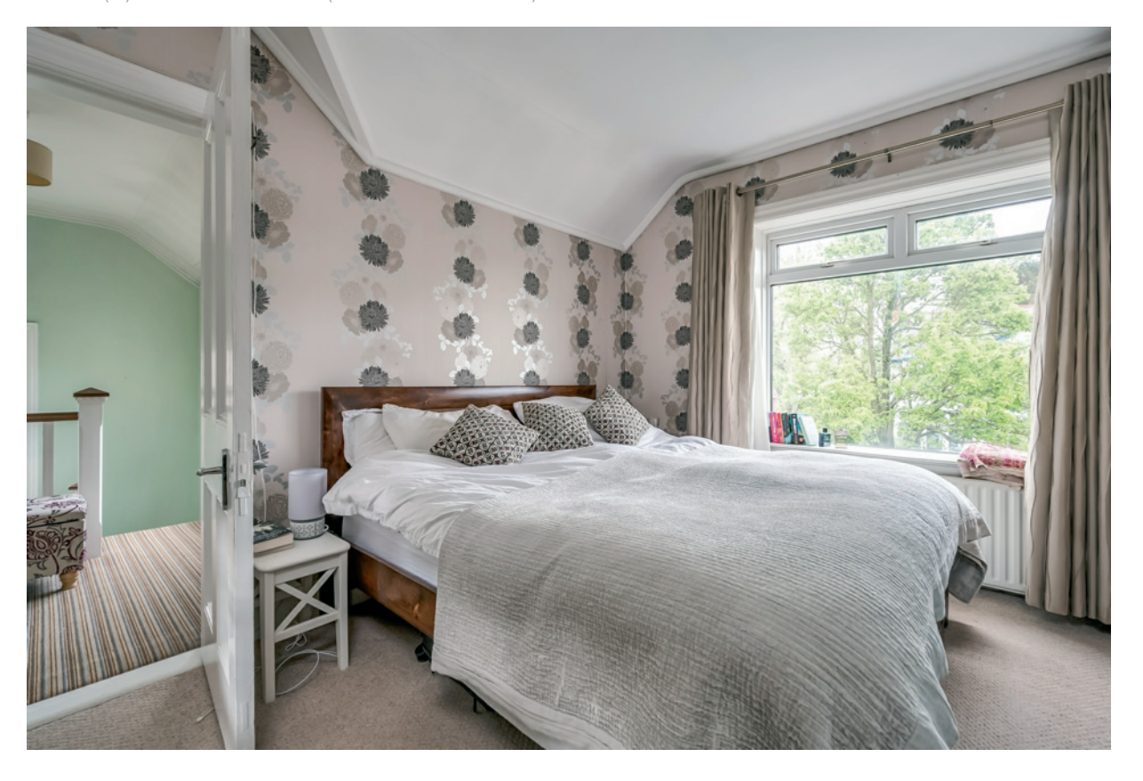
BEDROOM (2): 11' 8" x 11' 2" (3.56m x 3.4m)