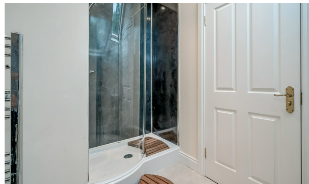
DETACHED DOUBLE GARAGE: 25' 6" x 24' 4" (7.77m x 7.42m) Remote control up and over doors, light and power. Staircase to . . . GAMES ROOM/HOME OFFICE: 25' 5" x 24' 4" (7.75m x 7.42m) Shower room with walk-in shower cubicle, wash hand basin, low flush wc, heated towel rail.